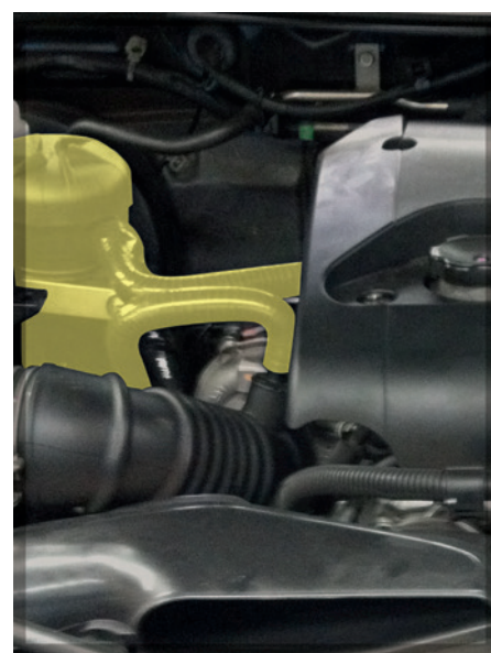
Step 9 / Img8: