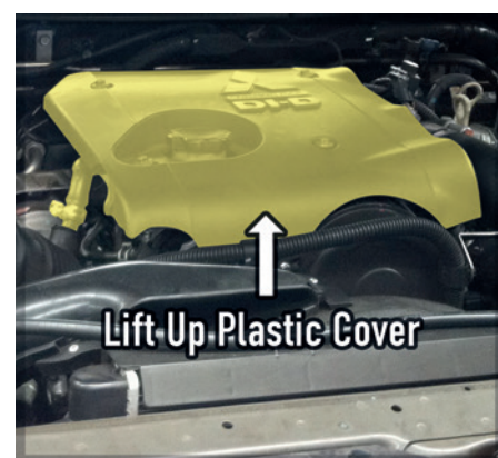
Step 2 / Img 1: