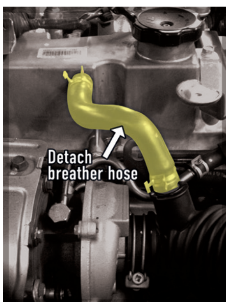
Step 7 / Img 6: