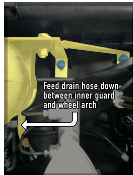
Step 6 / Img 5:

STEP 10: Re- it the Plastic Engine Cover (img8).