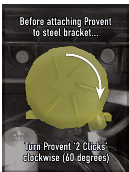
Step 3 / Img 2: