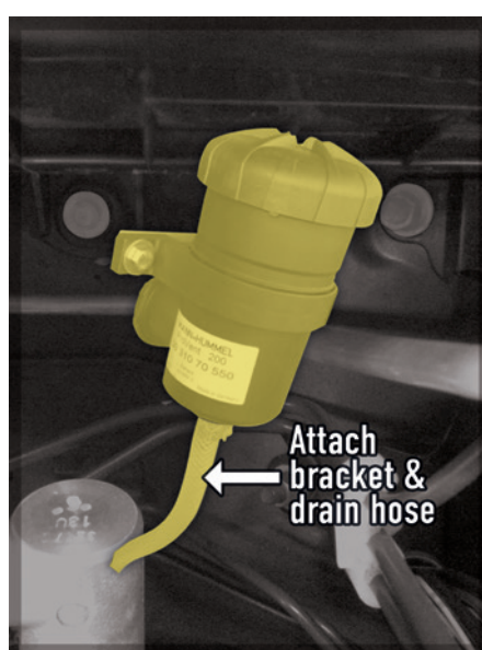
Step 4 / Img 3: