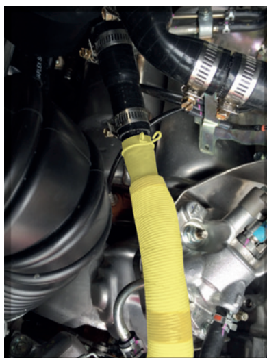
Step 8 / Img 8: