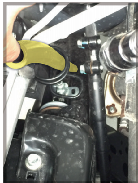
Step 5 / Img 3: (Img 4. next page)