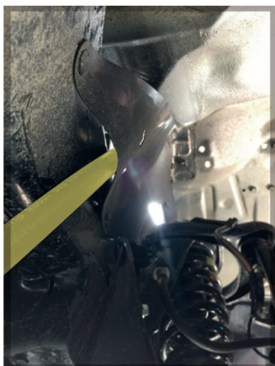
Step 5 / Img 4: