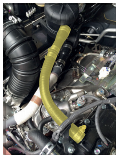
Step 9 / Img 9: