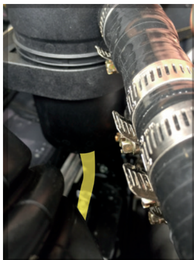
Step 6 / Img 5: