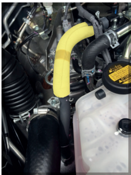
Step 3 / Img 1: