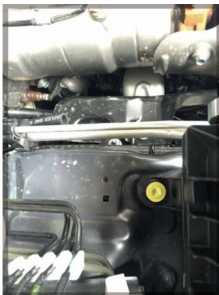
Step 4 / Img 2: