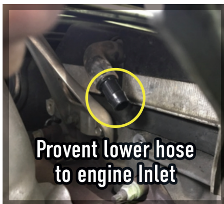
Step 9 / Img 9: