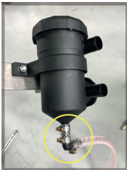
Step 4 / Img 3: