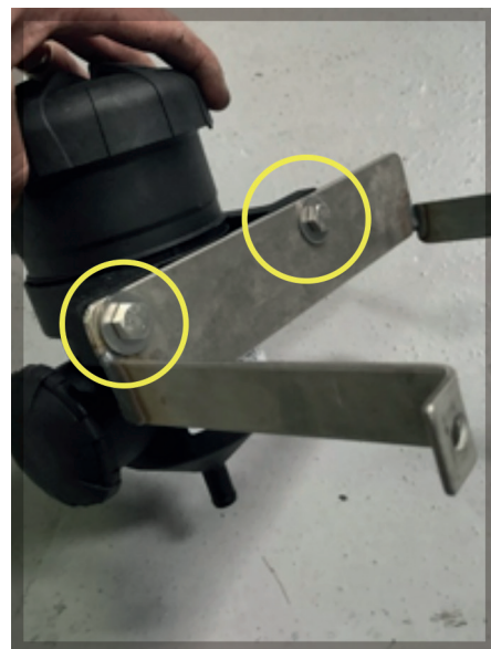
Step 5 / Img 4: