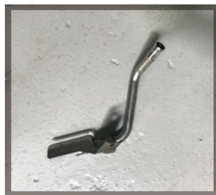
Step 8 / Img 7: