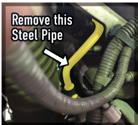
Step 8 / Img 8: