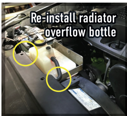
Step 7 / Img 6: