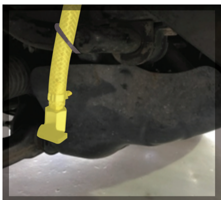
Step 7 / Img 5:

STEP 13: Re-install engine cover and job done ! The Mann Provent element should last for over 40,000 kms, we recommend you drain the system once a month into a cup & dispose of contents carefully.