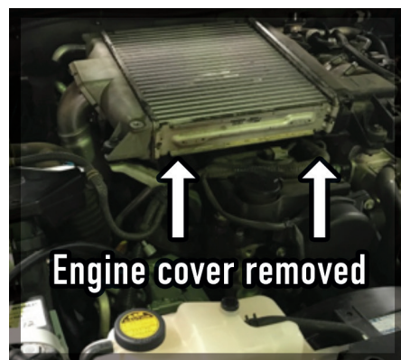
Step 2 / Img 1: