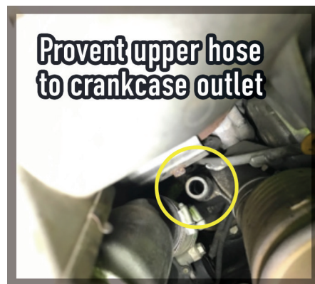
Step 10 / Img 10: