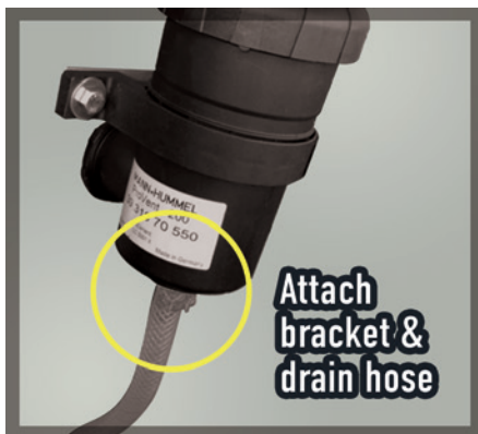
Step 6 / Img 5: