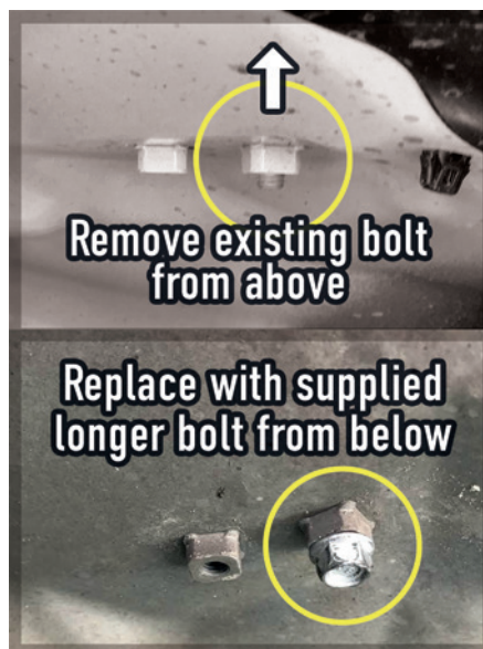
Step 4 / Img 3: