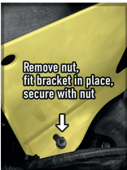
Step 3 / Img 2: