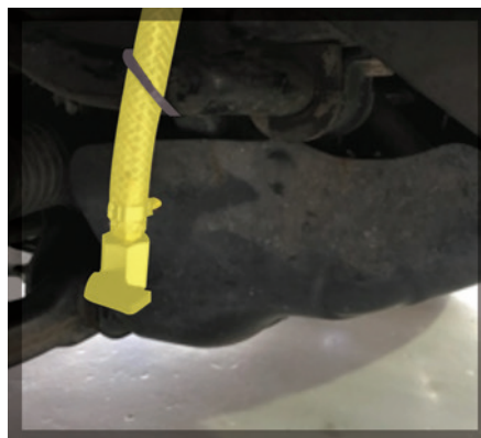
Step 7 / Img 6: