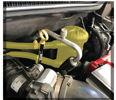
Image of Provent Kit Installed