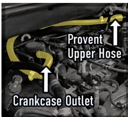
Step 9 / Img 8: