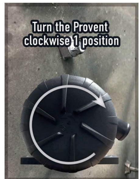
Step 5 / Img 4: