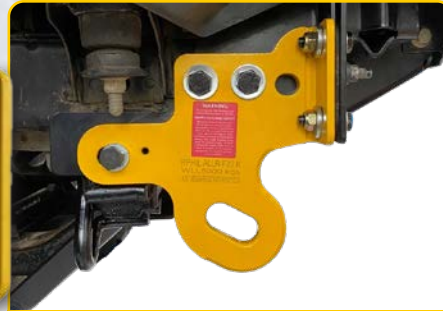
MUZZ BAR FITMENT